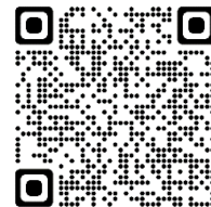
Peripheral Arterial Disease