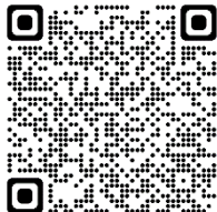
Chronic Kidney Disease