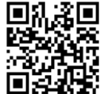
Subject Access Request For accessing results