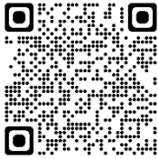
Long Term Conditions Website

Building a picture of your health is really important for us to be able to help you manage your long term conditions, and the QR codes below provide information and forms on our website where you can provide us with information; and also some links to the NHS Inform site