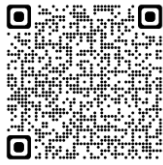
Long Term Conditions Diabetes