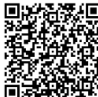
Home Blood Pressure