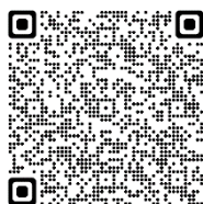
Long Term Conditions COPD

Building a picture of your health is really important for us to be able to help you manage your long term conditions, and the QR codes below provide information and forms on our website where you can provide us with information.